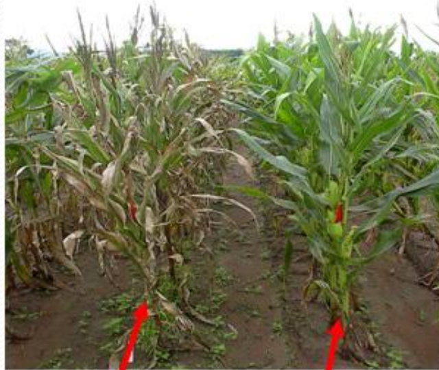
Striga susceptible line