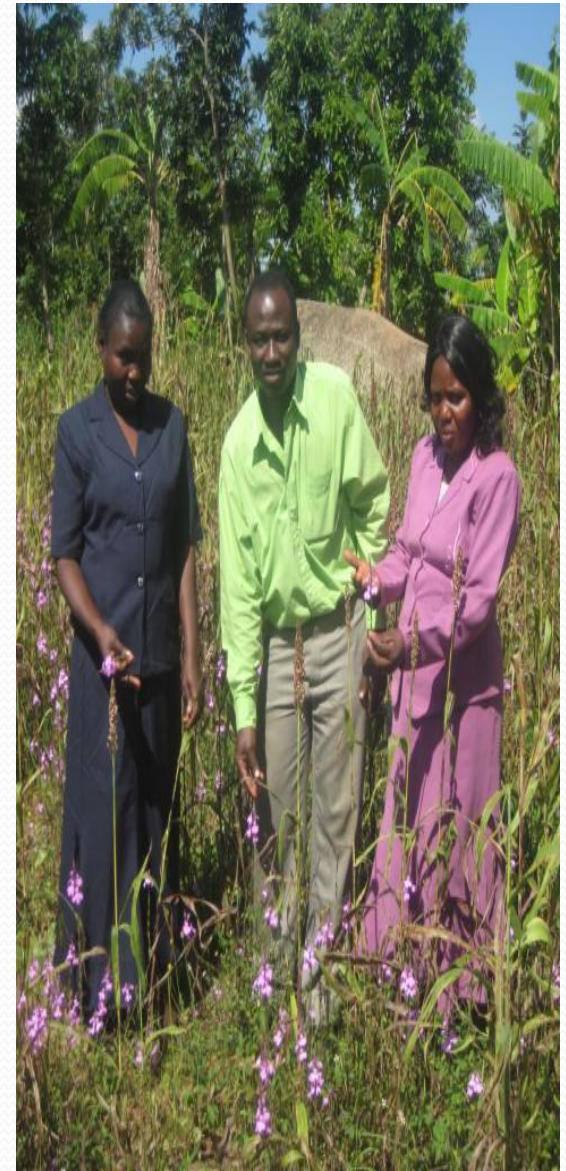
Striga resistant maize line