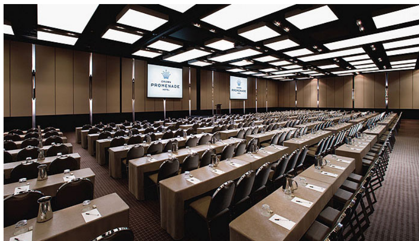
Promenade Room, Crown Conference Centre

Crown Conference Centre (CCC) is a sleek, modern venue in the heart of Melbourne's vibrant Southbank precinct. The CCC is minutes walk to Crown Casino, an abundance of restaurants, cafes and accommodation options and the heart of Melbourne's CBD. Featuring spacious rooms and the latest in audio-visual technology, the CCC will ensure AARES delegates will enjoy an outstanding Conference in an outstanding venue.