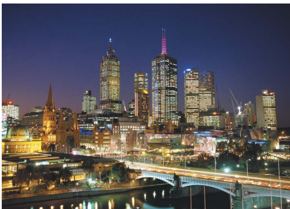
Melbourne CBD, Victoria