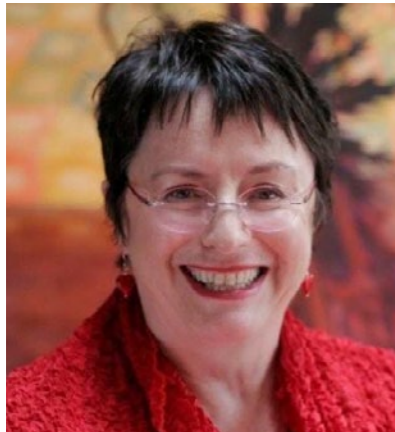
Rhonda Galbally AO